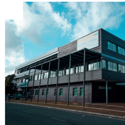
Centre for Dental Sciences